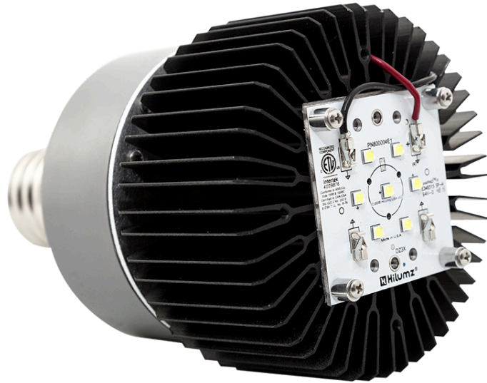
DZ3X (Vertical E39 Mount Shown - V3)