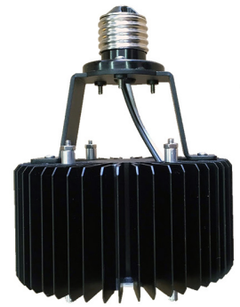
Vertical (V1) - Side