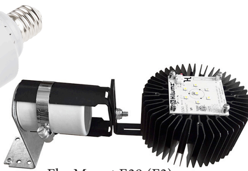
FlexMount E39 (F3)