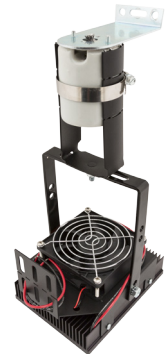
Vertical FlexMount to Mogul