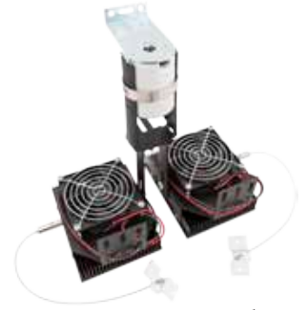
DM240 Vertical FlexMount to Mogul