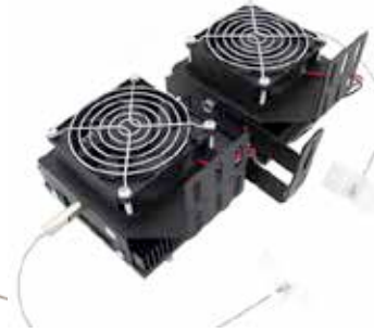
DM240 Back - Horizontal