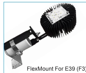
FlexMount For E39 (F3)