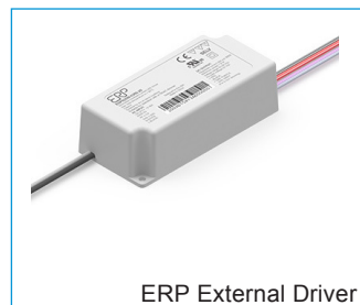
ERP External Driver