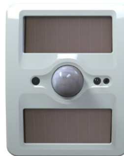
Solar Occupancy Sensor AJ-DIM-OA-SUN