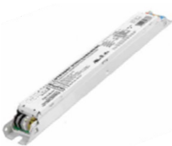
Driver with 12V Aux Output & Dim-to-Off

LED tubes with integrated drivers trap heat and are prone to early failure; regardless of their warranty claims. HiLumz linear retrofits use separate drivers and the light fixture metal to dissipate heat. Our extremely high lumens/watt typically allows two LED strips to replace four fluorescent tubes.