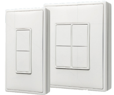
Switches - No Wires & Batteries AJ-DIM-OA-SUN